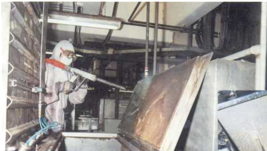
Figure 3: Partially cleaned mixer in a sweets factory